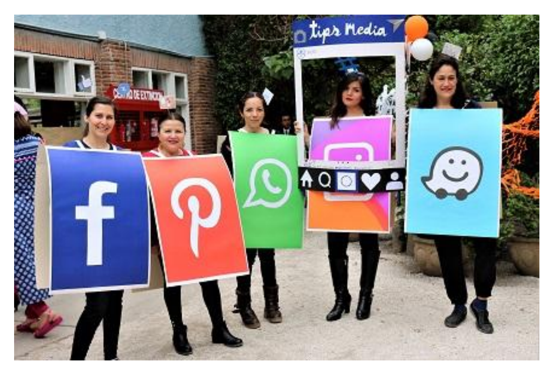
TIPS is all about the vanguard of communications nowadays. Obviously, we are into every way of communicating electronically.