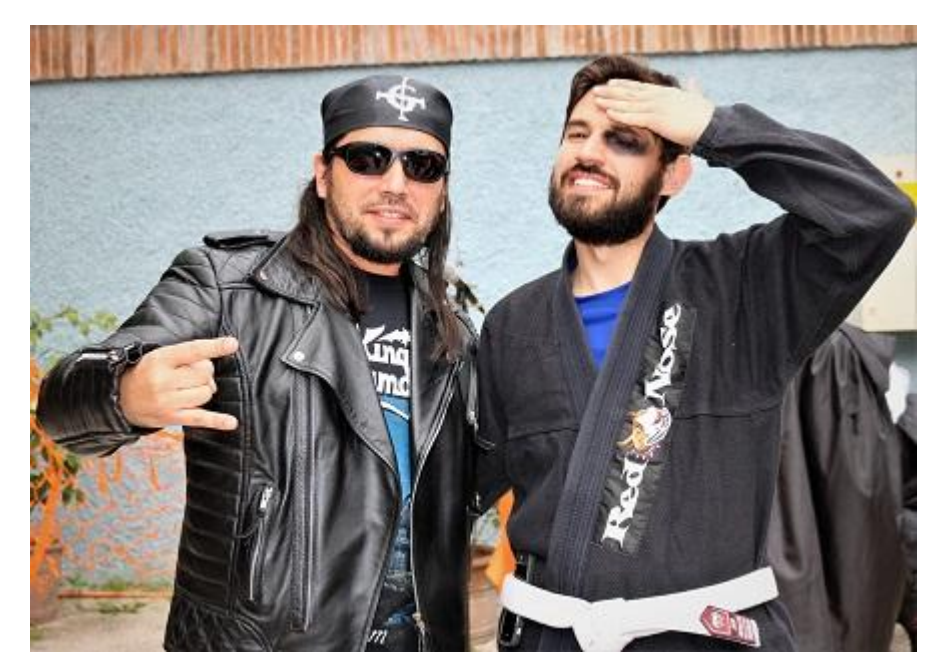
Do keep in mind that these are the people that educate your children. And, do not judge a book by its cover. All in good fun and fright.