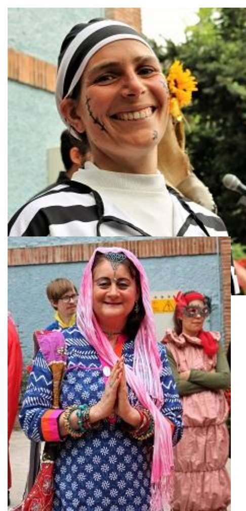
Our teachers are a varied group from diverse backgrounds.