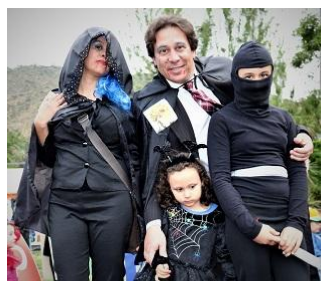
And a Happy Halloween was had by all.